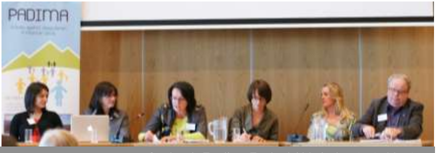
ninar in Trysil on Territorial Marketing, 24-25 May 2011

On 25th May, participants discovered on field some successful initiatives that have proven results in retaining and attracting population to remote mountain areas of Hedmark (Norway) and Dalarna (Sweden).