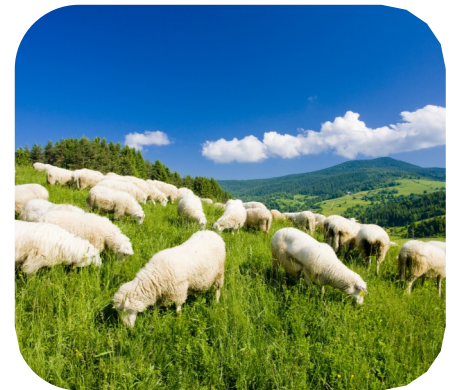
Italy's mountain livestock output amounts to 2500 M€

The new CAP clearly states and provides for the role of « active farmers » as providers of essential services, and figureheads in environmental protection, cultural preservation, social inclusiveness, and economical revival, also by means of the enhancement of tourist and agrotourist activities.