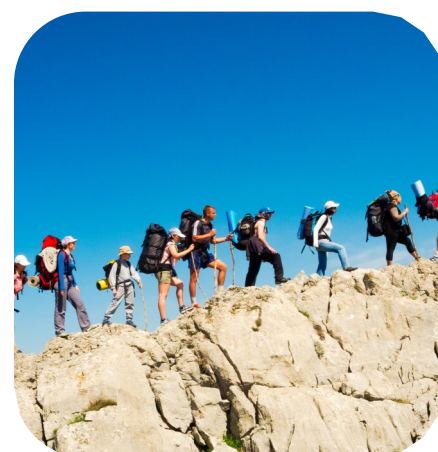
Mountains are Italy.

The Italian Rural Network LEADER Task Force has been following the debate led by GALs and Regions at local level between in order to build an informed participatory process for local actors and stakeholders on the opportunities and procedures of the 2014-2020 programmes.