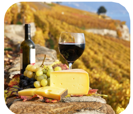
Italy produces 30% of the EU's mountain foods.