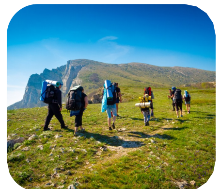
Traditional food quality and a preserved environment attract tourist.