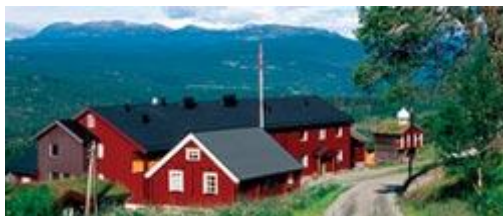
Ruten Mountain Lodge, Espedalen