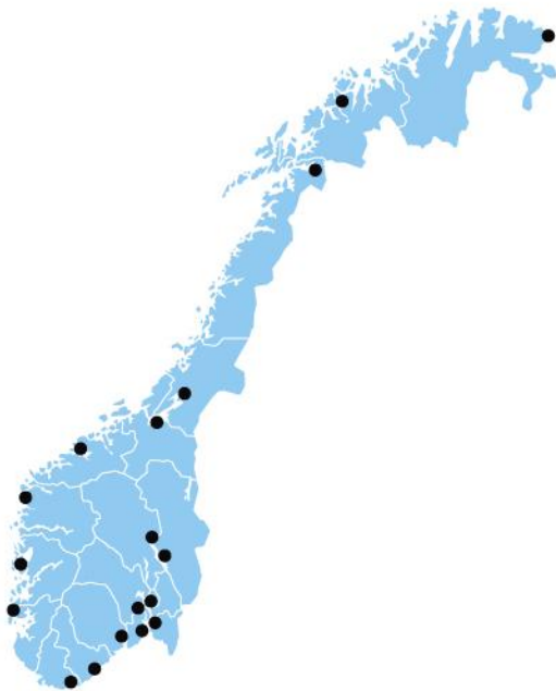
OFFICES IN EVERY COUNTY