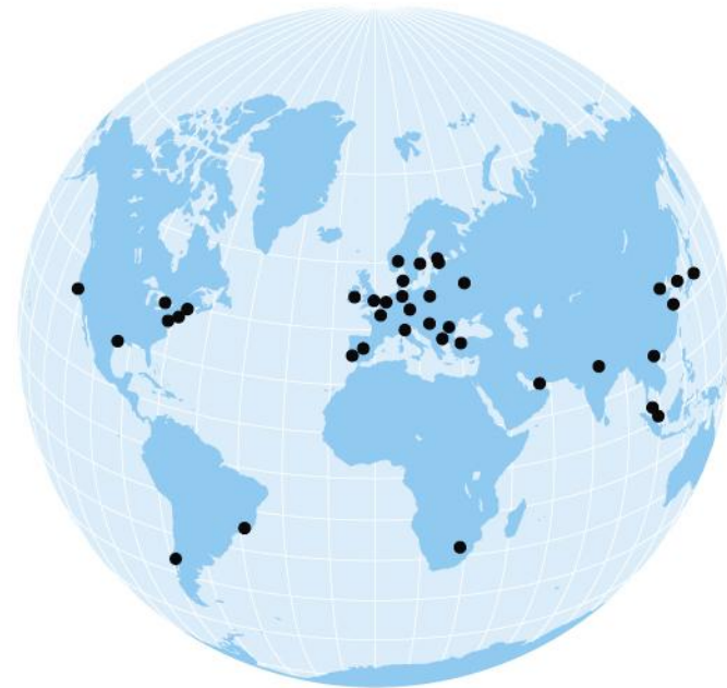
OFFICES IN MORE THAN 30 COUNTRIES