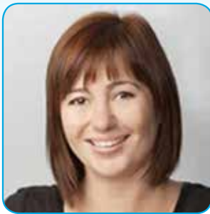
Francina ARMENGOL I SOCIAS, Chair of the Commission for Natural Resources (NAT) in the European Committee of the Regions

Why do we need a white paper on rurality?