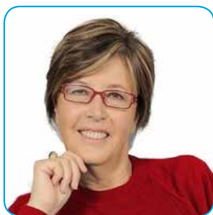
Mercedes Bresso, Chair of the intergroup on Rural, Mountainous and Remote Areas (RUMRA)

Rural, mountainous and remote areas are home to millions of citizens in the EU. In the political agenda, with the first talks and negotiations related to the new Multiannual Financial Framework (MFF) and the future of Cohesion Policy coming up, it is time for stakeholders in rural and mountainous regions to come together in