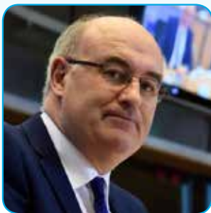
Phil Hogan, Commissioner in charge Agriculture and Rural Development