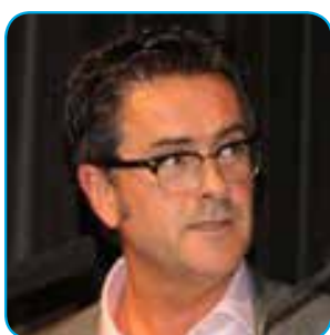
Juanan Gutierrez, President of Euromontana, the European association of mountain areas

Mountain areas cover 29% of the EU and are home to 13% of its population. They are vital sources of freshwater, biodiversity and places for recreation and inspiration. The mountains are also places of production, providing distinctive local quality foods, energy, and employment as well as many ecosystem services. These territories have strong innovation and growth potential that can contribute to achieving the goals of the Europe 2020 Strategy.