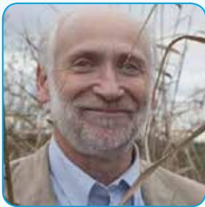
Gérard Peltre, Chairman of the international association Rurality-Environment-Development and the European Countryside Movement

The situation in the rural areas of the EU makes rural life a major aspect of the European venture. Rural areas, including those qualifying as peri-urban, account for 58% of the EU's population and 56% of its jobs. Rural areas in the 21st century are most diverse. Their assets go far beyond the primary sector: agriculture still determines land use, but secondary and tertiary activities have become very important for the economy and for employment.