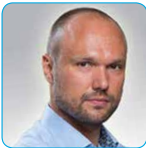
Randel LÄNTS, rapporteur for the own-initiative opinion on innovation and modernisation of the rural economy of the European Committee of the Regions

It is the belief of the European Committee of the Regions that only through an integrated approach to public policy will it be possible to tackle the economic, environmental and social challenges facing every part of Europe and rural areas in particular. It is therefore a matter of urgency to: