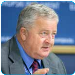
Czesław Siekierski, Chair of the European Parliament's Committee on Agriculture and Rural Development

The Cork 2.0 Declaration adopted on 6 September 2016 mentions that “Rural and agricultural policies must interact with the wider context of national and regional strategies and work in complementarity and coherence with other policies”. Do you think that drafting a white Paper on rurality would help meeting this goal?