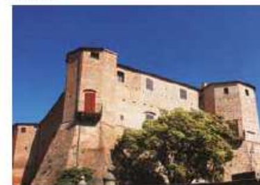
Santarcangelo - Malatesta Castle