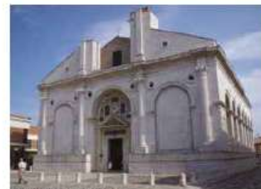
Rimini - Tempio Malatestiano