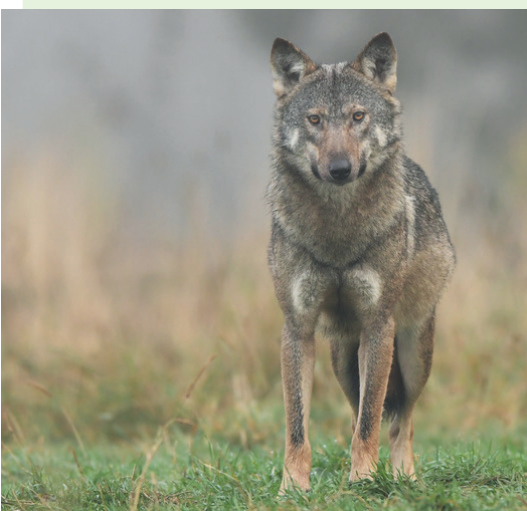
Bildnachweise: Titelseite (Wolf): kwasnyz21 Fotolia, 2. Seite (Schafe und Herdenschutzhund) C. Emmerich WZI, (Wolf) kwasnyz21 Fotolia