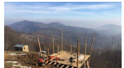
Preparation of an open-air theatre in Paraloup

The project partners are currently working on a detailed map with the migration routes "Migracard Circuit Map" that will be ready by 2019.