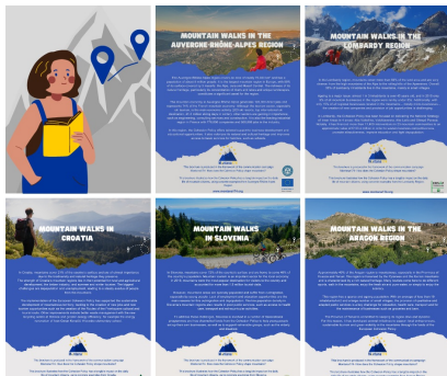
15 citizens' stories to see how Cohesion Policy makes a change in mountains