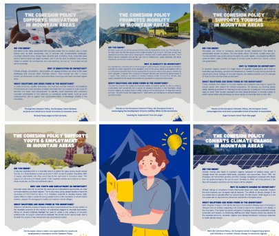
25 ways to improve living conditions in mountains via the Cohesion Policy

Whether you are an entrepreneur, a mountain guide, a retiree, a student or an employee, you may unknowingly encounter Cohesion Policy in your daily life. Through the profiles of 15 mountain citizens, Montana174 shows you how Cohesion Policy improves people's lives.