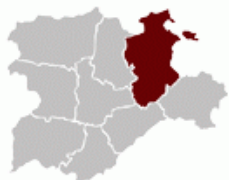
Castilla y León